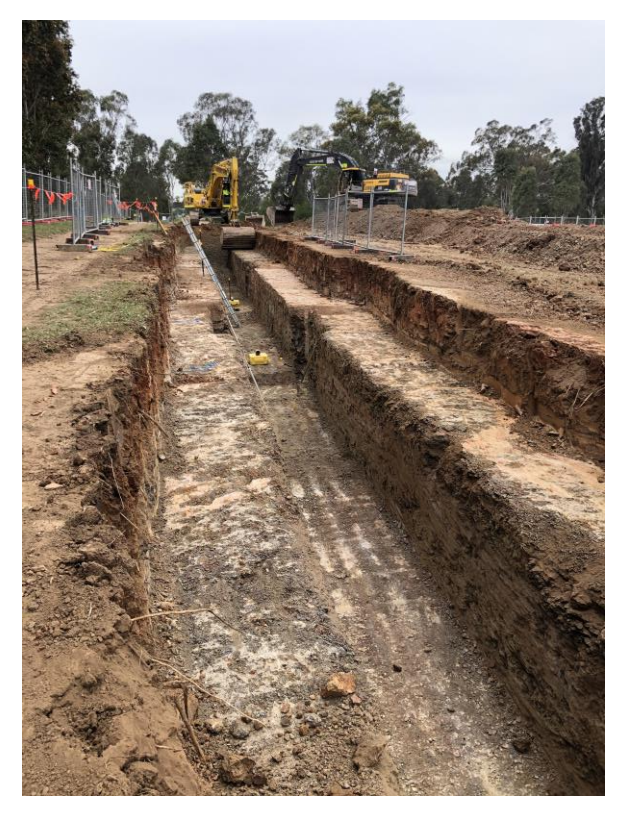
Construction of a new water pipeline at the Sydney International Shooting Centre in Cecil Park

On weekends, high noise impact activities such as rock breaking (hammering) and jack hammering will not start until after 8 am. These activities will be programmed so a one-hour respite break is provided after three hours of these activities.